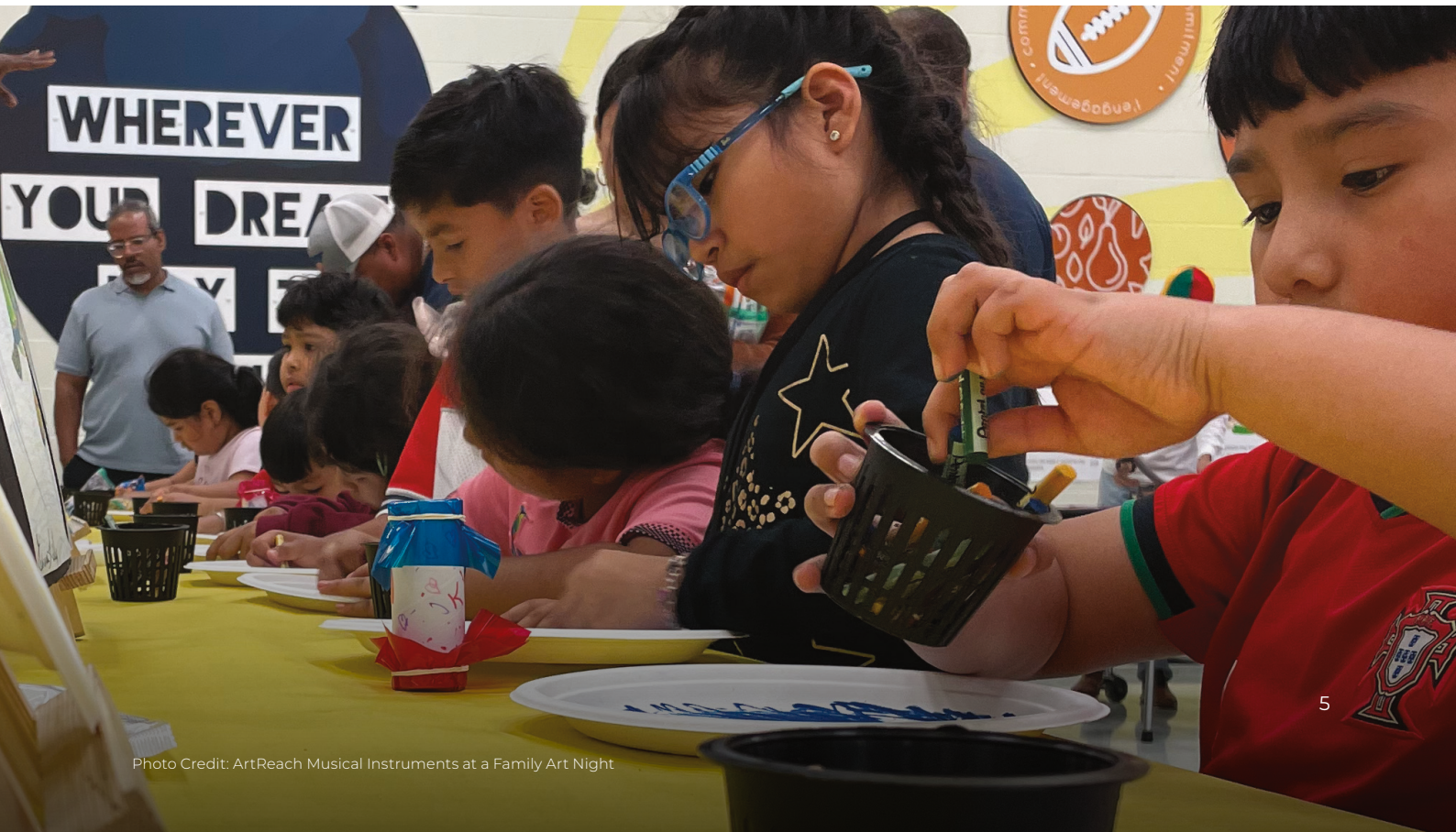
Musical Instruments at a Family Art Night

We have spent more than a decade building relationships, coordinating efforts, and sharing resources. We have seen year over year that, by working together, we have amplified our voices and strengthened our power, guided by the idea that when students prosper, our community thrives.